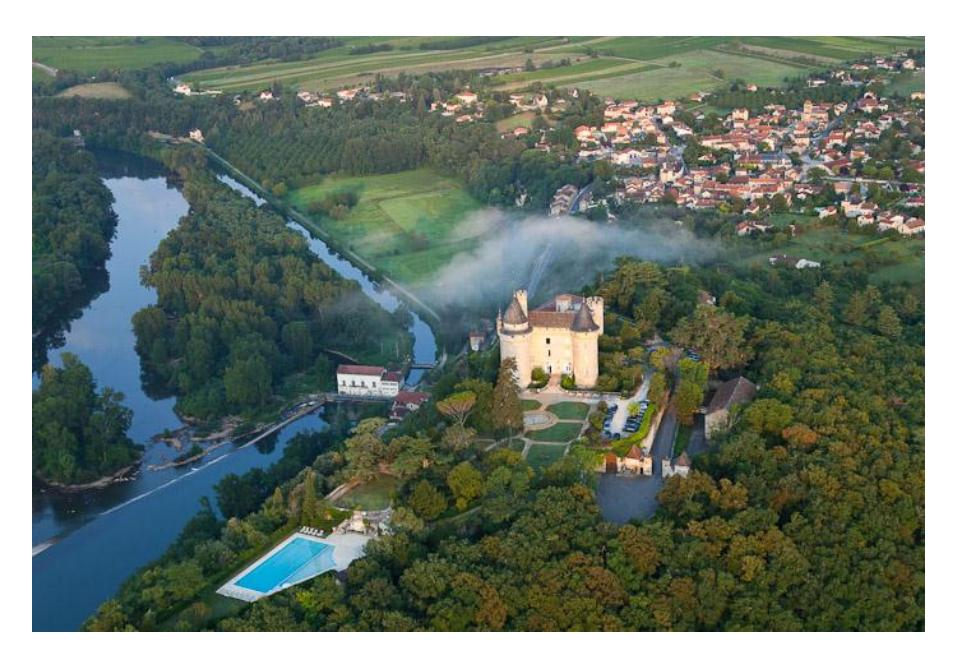
Chateau de Marcues

We then have another wonderful driving day first over the Montagne Noire in the Massif Centrale before heading through the Foret de Gresigne until we arrive just north of Cahors in the spectacular Chateau de Mercues , on the edge of a gorge overlooking the river.