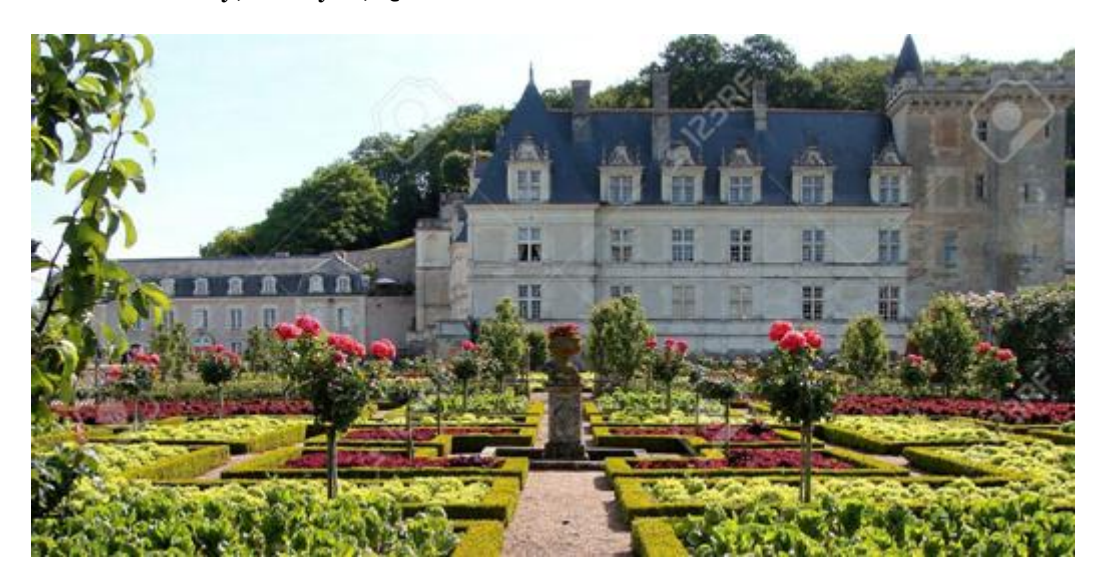
Chateau de Villandry and Gardens

The Loire valley has a very mild climate and is famous for its wines and beautiful gardens growing the best roses in France. It has some amazing chateau, including Chambord, Chaumont, Chenonceaux and Azay-le-Rideau. We plan to visit the Chateau du Lude which has a wonderful lower garden along the river bank and a magnificent Kitchen Garden and is owned by a friend of a member. The nearby Chateau de Villandry is one of the last renaissance chateau to be built on the Loire and has absolutely exquisite gardens. During our stay we can also visit the huge wine cellars in Saumur, where there is also the famous Cadre Noir riding school, stables and magnificent horses. At nearby Fontevraud Abbey, Henry II, Queen Eleanor and Richard the Lionheart are buried.