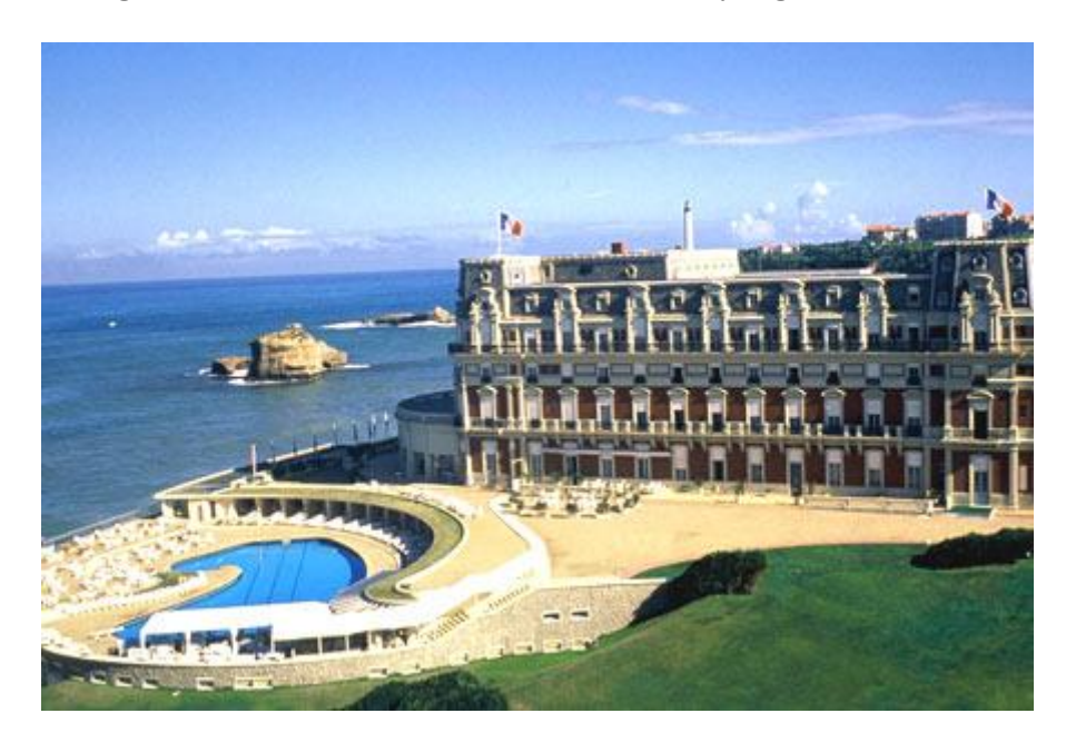
Hotel du Palais, Biarritz

After a night to refresh ourselves and after a wash and polish we will present the cars for an inspection and Concours to decide which car has performed the best on tour and which is the most elegant before retiring for our final dinner of the tour on Sunday night.