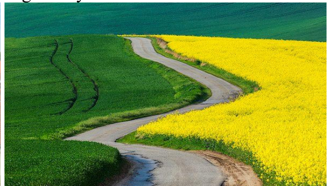
The Moravian countryside

After this, we will journey south to Esztergom, capital of Hungary (before the rule of the Habsburgs) in the 10 th to 13 th centuries and the site, on the Danube Bend, of the massive Esztergom Basilica and a stunning museum of Christian paintings.