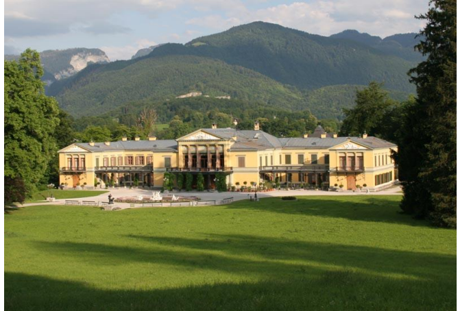
Kaiservilla, Bad Ischl

In the Salzkammergut participants will enjoy touring around the lakes such as Hallstättersee, Alt-Ausseerese, Grundlsee or Töplitzsee and hill climbing in the Sölker Tauern National Park with a visit to Stift Admont, the Benedictine Monastery and the world’s largest abbey library – or just relax in Schloss Pichlarn, a former retreat of the Admont Abbots, now a well-regarded castle hotel.