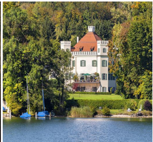
Possenhofen Castle, where Sisi grew up

The tour will begin just south of Munich, near Possenhofen, the childhood home of Sisi, on Lake Starnberg in Bavaria. From our first hotel, Kaiserin Elisabeth, where Sisi was a regular guest, we will drive to Schloss Neuschwanstein, the 19 th century Palace commissioned by Ludwig II of Bavaria, also known as the “Mad King”. He was Sisi’s cousin and also her confidant. The drama of Ludwig’s mysterious death on 13 th June 1886 - he drowned in Lake Starnberg - while Sisi was vacationing in “our” Hotel on the opposite bank.