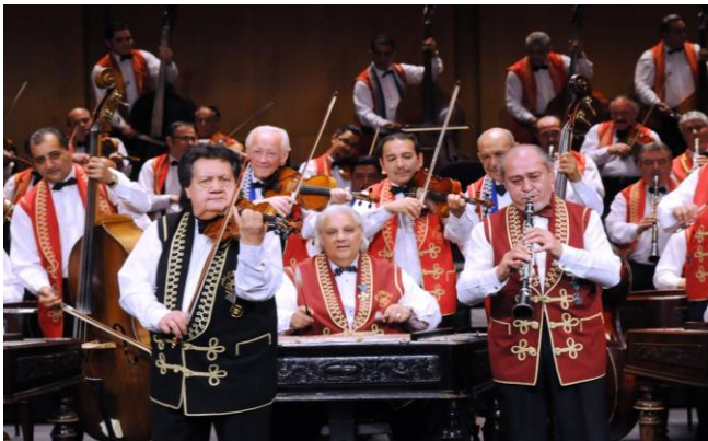
Gypsy music in Budapest

On the final evening (Saturday 25 th June) there will be a private tour and black tie gala dinner at the Royal Palace of Gödöllő, 20 miles from Budapest. This will round off the story of Sisi's life. It will add a final romantic touch to the tour. Gödöllő was Hungary's "Coronation Gift" to her (and Emperor Franz Joseph) in 1867 - a thank you present, for Sisi's advocacy and supportive political influence. Sisi was a great lover of Hungary and freedom. Gödöllő was also the birthplace of her youngest daughter, Marie Valerie.