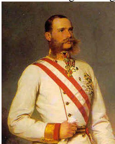
Emperor Franz Joseph

The tour of 16 nights (through Bavaria in southern Germany, Austria, Moravia in southern Slovakia and Hungary) will bring to life the last century of the Habsburg Monarchy with all its pomp and glory but also with all the ups and downs of Imperial family life. We will tour through wonderful countryside and visit the capitals of three countries: Vienna, Bratislava and Budapest. It will be based around the lives of the Imperial couple, Emperor Franz Joseph I and his wife Empress Elizabeth (known as Sisi). Franz Joseph was both the Emperor of Austria and the King of Hungary.