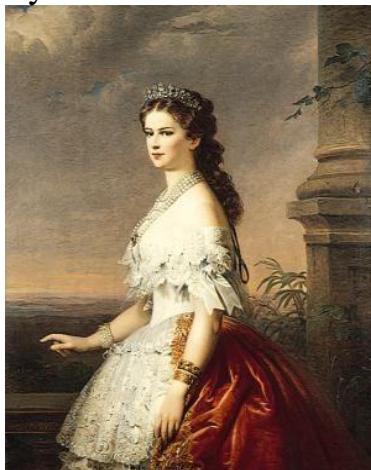
Empress Elizabeth (Sisi)