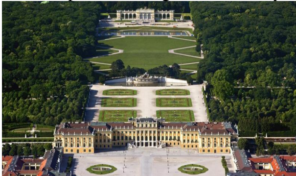
Schönbrunn Palace, Vienna

Kirche, where Sisi and Franz Joseph were married in 1854 and Kapuzinergruft, where they are buried along with 12 Emperors and many members of the dynasty. On Sunday you will take your cars for a “Tale of the Vienna Woods Tour” with superb views of Vienna and the Danube, a stop at a “Heurigen” in its vineyard and/or at the Monastery of Klosterneuburg.