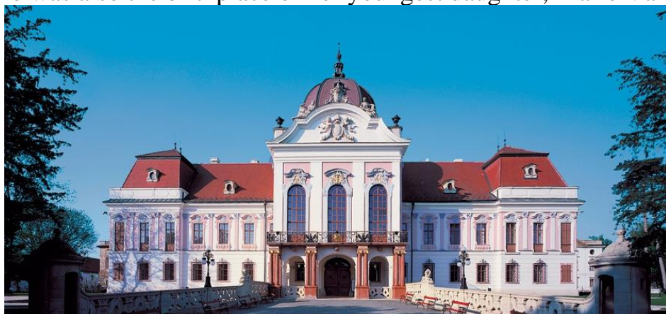
The Royal Palace of Gödöllő, formerly Grassalkovich Castle

On the final evening (Saturday 25 th June) there will be a private tour and black tie gala dinner at the Royal Palace of Gödöllő, 20 miles from Budapest. This will round off the story of Sisi's life. It will add a final romantic touch to the tour. Gödöllő was Hungary's "Coronation Gift" to her (and Emperor Franz Joseph) in 1867 - a thank you present, for Sisi's advocacy and supportive political influence. Sisi was a great lover of Hungary and freedom. Gödöllő was also the birthplace of her youngest daughter, Marie Valerie.