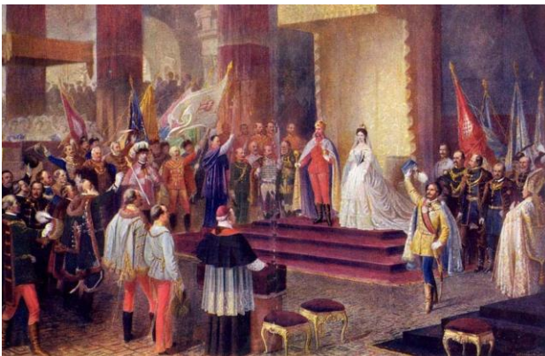
Coronation in the capital, Buda, 8 th June 1867