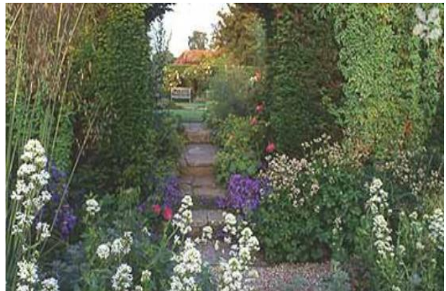
Tintinhull Arts & Crafts Garden