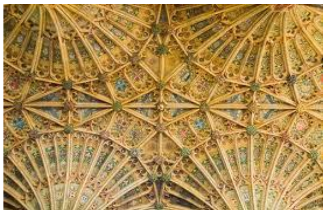
Sherborne Abbey with its spectacular fan vaulting

Note: Stourhead, Barrington Court and Tintinhull are all National Trust properties.