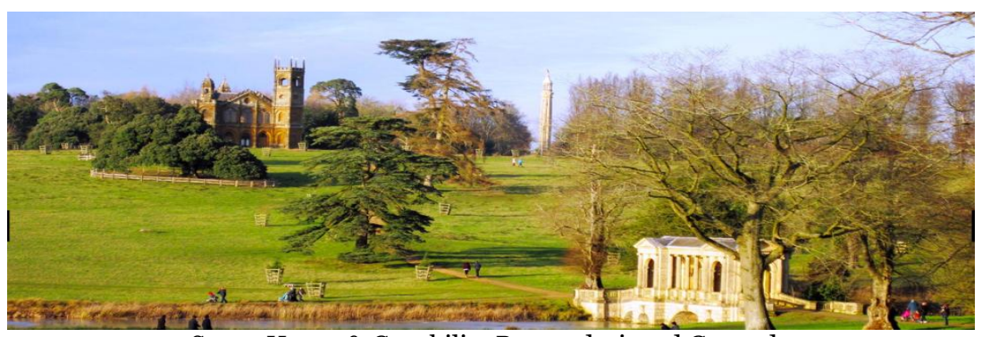
Stowe House & Capability Brown designed Grounds