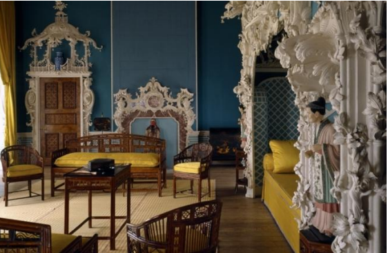
The Chinese Room Claydon House (NT)

The event includes two nights Dinner Bed and Breakfast at The Manor Country House Hotel which is co-incidentally the exact Hotel used for the very first gathering of The 20-Ghost Club almost 70 years ago — wonderful continuity.