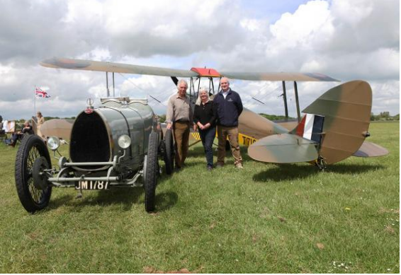
Last minute instructions Kop Hill Climb