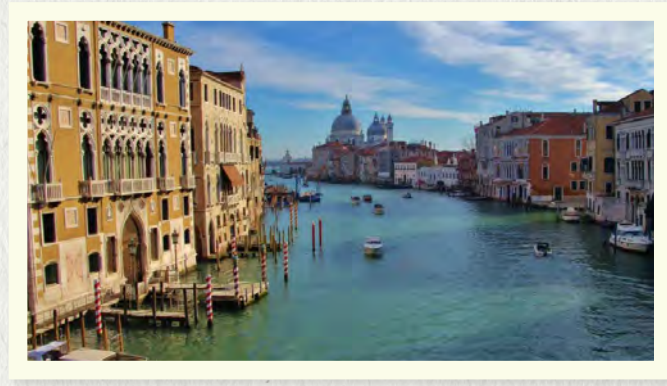
Sunday 18th and Monday 19th June Hotel Danieli, Venice, Italy About 180 km

Thursday I5th, Friday I6th and Saturday I7th June Hotel Splendido Bay Luxury Spa, Lake Garda, Italy. About 230 km