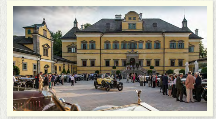
Sunday 25th June Hotel Friesacher, Salzburg, Austria About 223 km