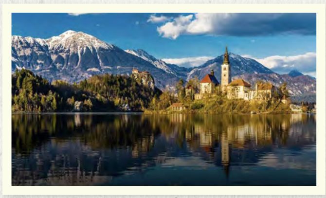
Saturday 24th June Grand Hotel Toplice, Bled, Slovenia About 158 km