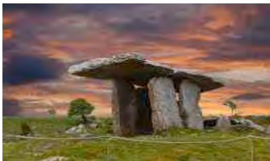
A cromlech in the Burren