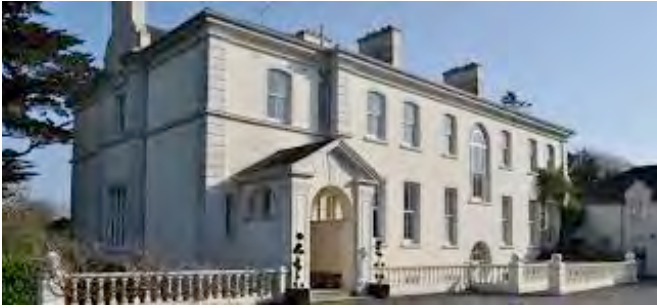
Lis Ard House