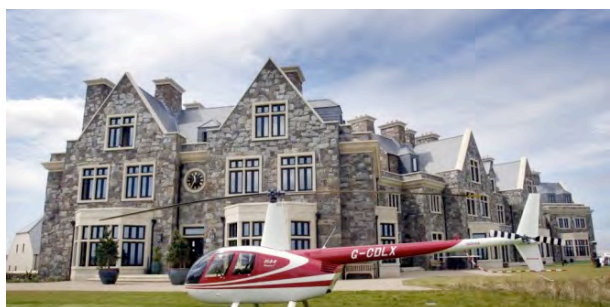
Doonbeg Golf Hotel – and D Trump's helicopter?