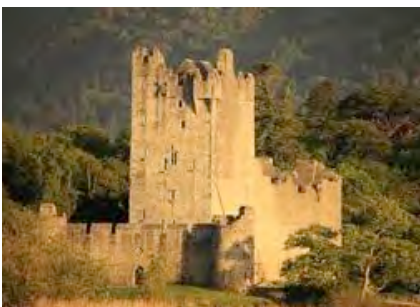
Ross Castle, Killarney

The following day [22 nd ] we will drive some of the wonderful Ring of Kerry and over the Iveragh Mountains – some of the most breathtaking scenery in Ireland – and right out to the western tip of the Ring. This drive can be a figure-of-eight for the adventurous, and a shorter circle for others. The Ring of Kerry became popular after Queen Victoria visited Killarney in 1861 with Prince Albert, just four months before his death. They stayed for three days as part of their 80day visit to Ireland, were entranced by the beauty of the area, and one of the most stunning viewing points was called 'Ladies' View', in honour of her ladies-in-waiting. Killarney is sadly rather too touristy now, but is still a pleasant little town, with shops and restaurants, and an imposing 19 th century cathedral.