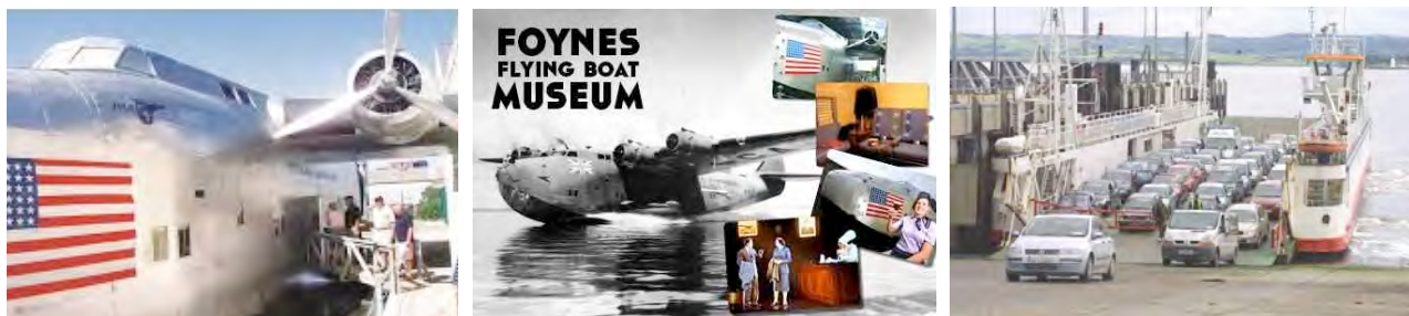
The Foynes Flying Boat Museum, and the Tarbert – Killimer ferry across the river Shannon

It will be a reasonably leisurely drive of 112 kms altogether on Saturday 23 rd from Glenbeigh through Tralee and Listowel to Tarbert, on the southern bank of the River Shannon, the ferry over to Kiltrush, Co. Clare, and then to Doonbeg, near Kilkee on the Clare coast. We will have time to visit the Flying Boat Museum at Foynes, near Tarbert; this was the first landing place in Europe when cross-Atlantic flights started in the 1930s, and also where Irish coffee was invented in 1943, to warm up some particularly cold American passengers. It is the only flying museum in Ireland, and is fascinating.