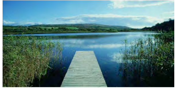
Lis Ard's lake