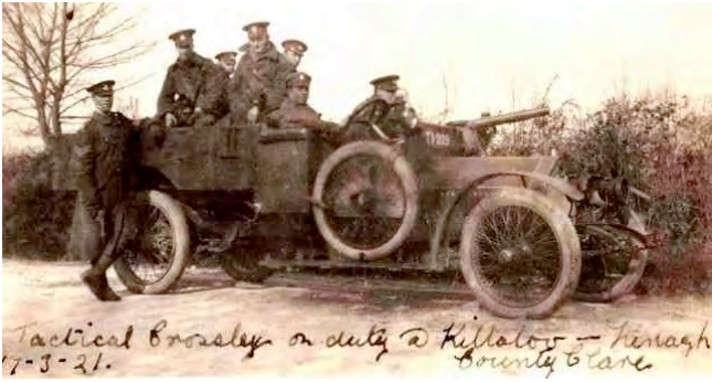
British soldiers at Killaloe in 1921 – driving a ..... ?