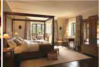
Ard na Sibhe – exterior and interiors

The following day [22 nd ] we will drive some of the wonderful Ring of Kerry and over the Iveragh Mountains – some of the most breathtaking scenery in Ireland – and right out to the western tip of the Ring. This drive can be a figure-of-eight for the adventurous, and a shorter circle for others. The Ring of Kerry became popular after Queen Victoria visited Killarney in 1861 with Prince Albert, just four months before his death. They stayed for three days as part of their 80day visit to Ireland, were entranced by the beauty of the area, and one of the most stunning viewing points was called 'Ladies' View', in honour of her ladies-in-waiting. Killarney is sadly rather too touristy now, but is still a pleasant little town, with shops and restaurants, and an imposing 19 th century cathedral.