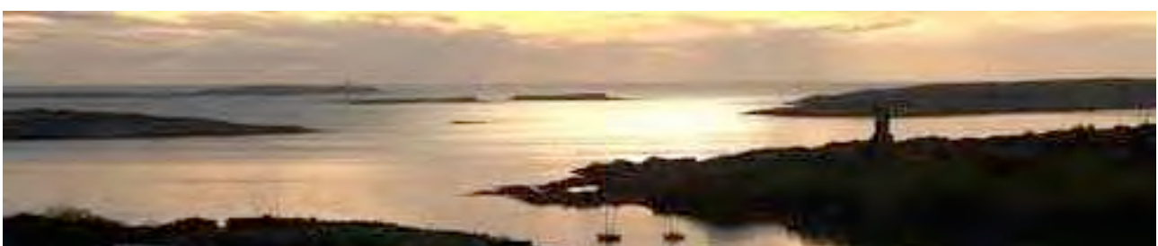
Roaring Water Bay, Co Cork, in the evening sunset

Without wanting to complicate matters any further ..... the Irish Veteran and Vintage Car Club is holding its 40 th Anniversary Gordon Bennett Commemorative Rally from Friday 4 th to Monday 7 th June in Co. Meath, west of Dublin. Some members may like to participant in that event, which is always great fun; however, only cars built before the end of 1930 are eligible. If required, storage for cars can be arranged between 27 th May and 4 th June. Advice can be also given about accommodation outside the tour dates, to be booked by participants themselves. If you are interested, please indicate this on the application form and further details will be sent to you.