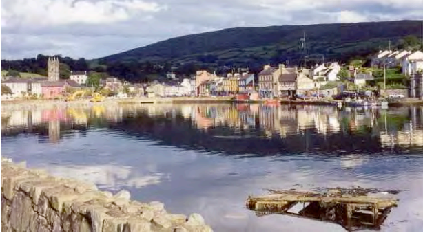
Bantry town and harbour