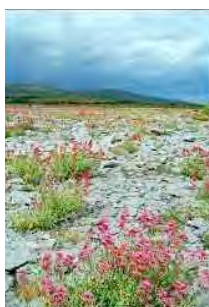
Flowers in the Burren