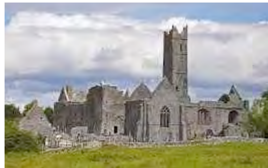
Quin Abbey, Co Clare

On Monday 25 th we drive eastwards through Ennis to the pretty little town of Killaloe, on the Shannon. From there we drive around Lough Derg to Portumna, to a private 18 th century country house near Birr for lunch. From there, we go on through Durrow and Kilkenny city to the final hotel, Mount Juliet, at Thomastown, a few miles south of Kilkenny, a journey of just over 200 kms. Mount Juliet is a superb Georgian mansion built 1757 by the Earl of Carrick, who named it after his wife; in 1914 it passed in the McCalmont family, who sold it in 1987, since when it has been a luxury 5-star hotel. We stay there overnight, after dinner in the hotel's Michelin-starred restaurant, and the tour will officially end the following day, perhaps after lunch. But anyway it is an easy drive from there to either Dublin [145 kms] or Rosslare [76 kms], and the ferry journey back to the UK.