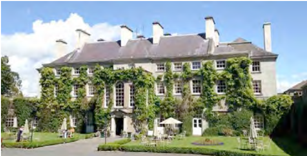
Mount Juliet House