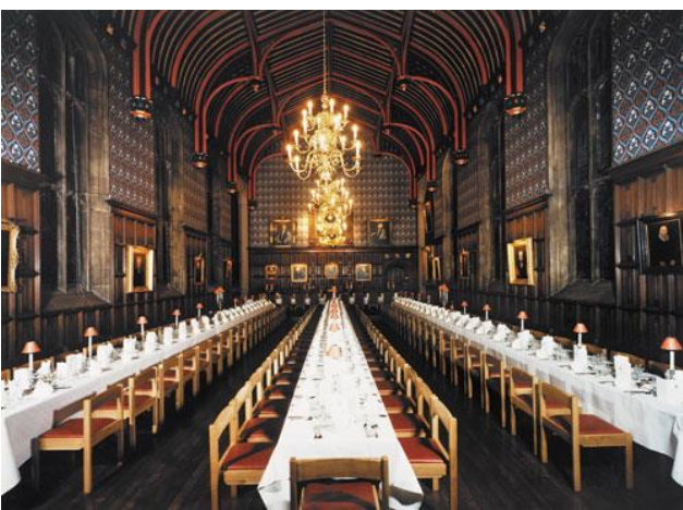
The 11<sup>th</sup> AGM and Dinner of the 20-Ghost Club Limited, incorporating the 65<sup>th</sup> AGM of the 20-Ghost Club will be held at Corpus Christi College, Cambridge, on Saturday 28<sup>th</sup> February 2015.

We are extremely fortunate to be dining in Hall at Corpus Christi, one of Cambridge's oldest Colleges, founded in 1352.